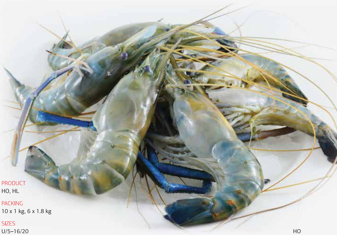
PRODUCT HO, HL PACKING 10 x 1 kg, 6 x 1.8 kg SIZES U/5-16/20